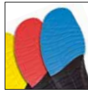
Vario Wide Fit System